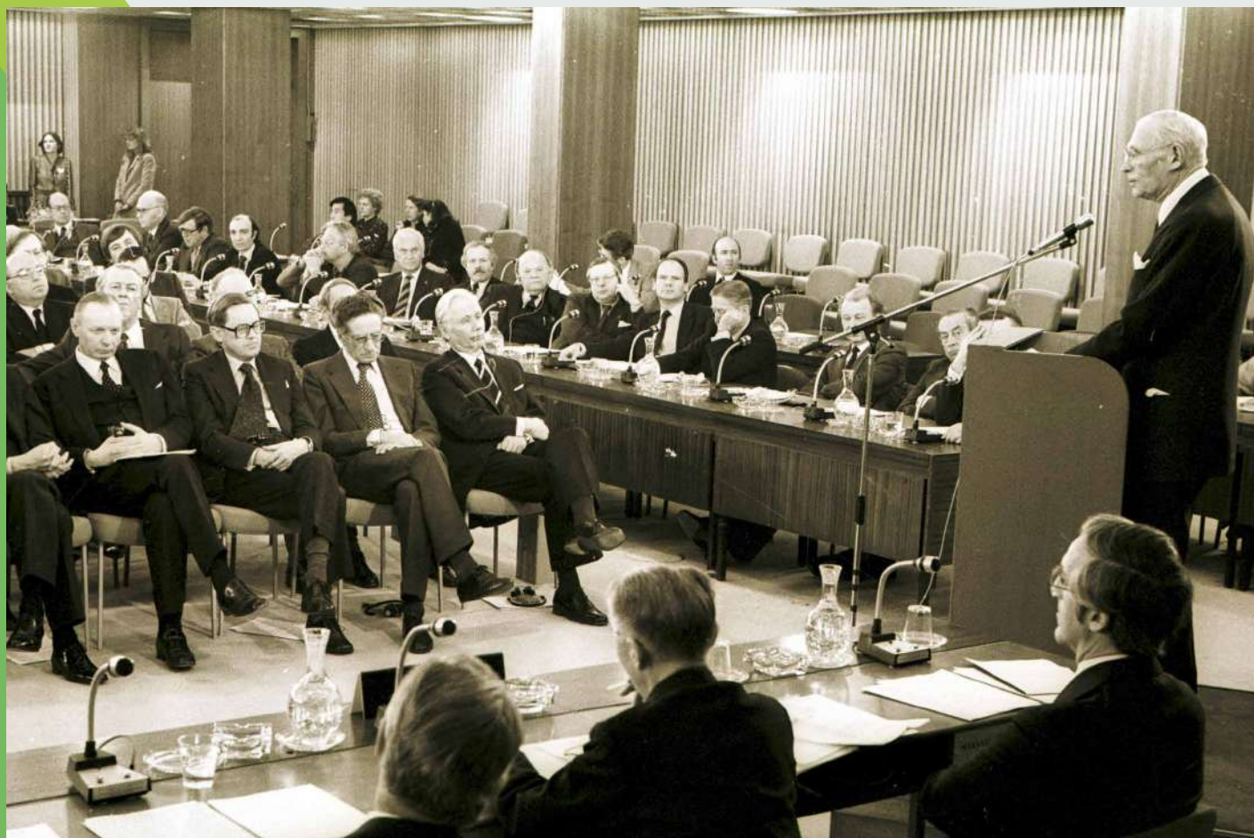
Dr. Marcus Wallenberg, first chair and founder of BIAC, reflecting on 20 years of business partnership with OECD and discussing priorities for the future at a meeting commemorating 20 years of BIAC (March 1982)