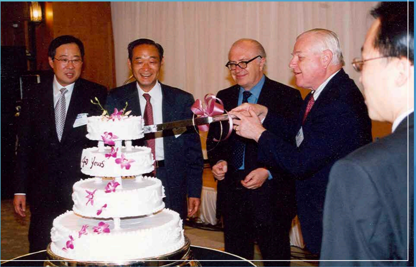
40th Anniversary Commemoration of BIAC (2002)