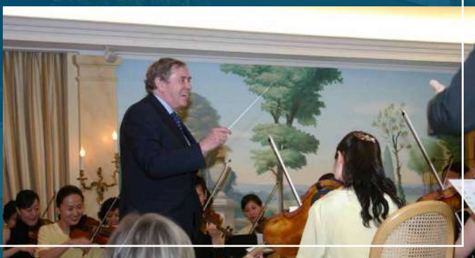
Former OECD Secretary -General Donald Johnston at BIAC dinner

We cannot talk about the development of the OECD without referring to the leadership of US Secretary of State General George Marshall, who enabled European economic reconstruction thanks to American aid under the European Recovery Program, better known as the Marshall Plan. In 1948, countries established the Organization for European Economic Co-operation (OEEC), a precursor to the OECD, to help administer the Plan.