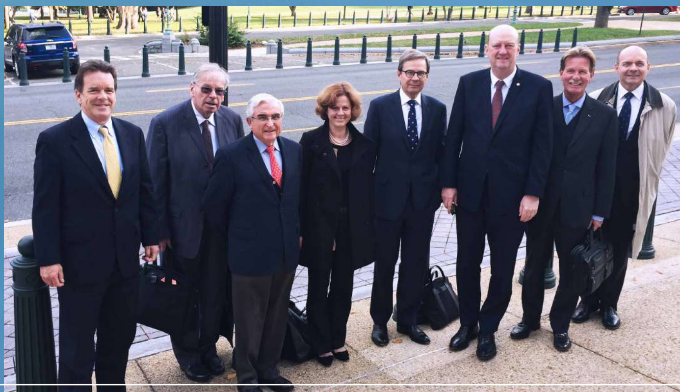
Board Meeting, Washington, D.C. (2017)