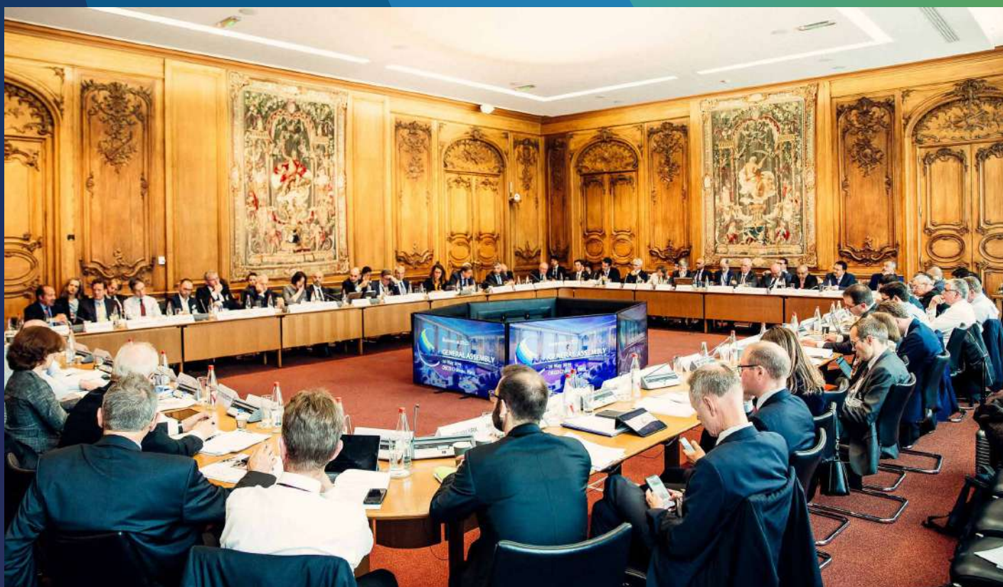
General Assembly, Paris (2019)