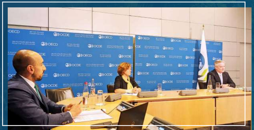
Conversation with Mathias Cormann (2021)