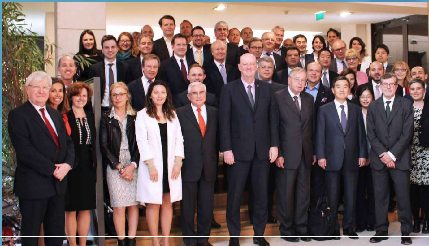
General Assembly, Paris (2017)