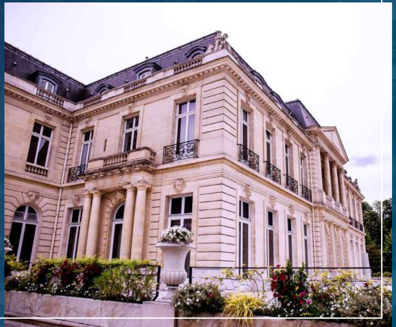
OECD Château de la Muette

By actively participating in our daily work, Business at OECD has informed our deliberations with the perspectives of over 7 million businesses around the world. As we look to the future, the work of Business at OECD will remain vital to our policy recommendations and prove the essential role of stakeholder engagement in building a better future. We count on Business at OECD to stay in the fight to end the health, economic, and social crises caused by the COVID-19 pandemic and build a green, inclusive, and resilient recovery for all.