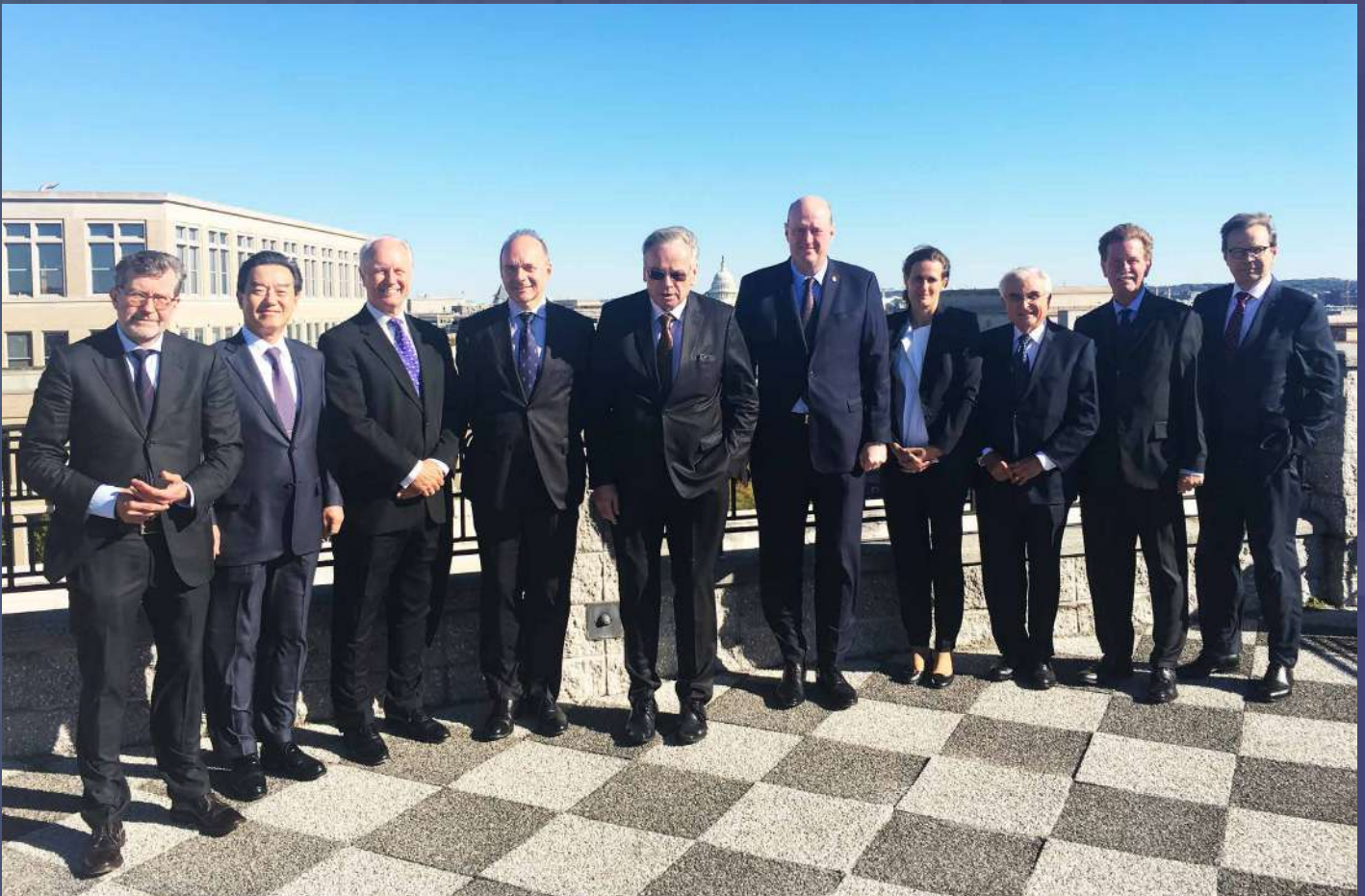
Board Meeting, Washington, D.C. (2017)

The last sixty years have shown us that businesses, governments, and OECD stakeholders can achieve great success when working together towards common goals. We need to continue to work with governments to show them that it is not an “us versus them” proposition, it is simply “us”. And there is no better place, no better forum than the OECD to powerfully and convincingly demonstrate that business is a dynamic solutions partner. We are the real economy, we are the people who employ people, the people who raise and deploy capital. As an agile and representative business body, we step into our 7th decade with a firm belief that the world is improved by the function and work of the OECD, and that Business at OECD will continue to be an essential and integral part of that effort.