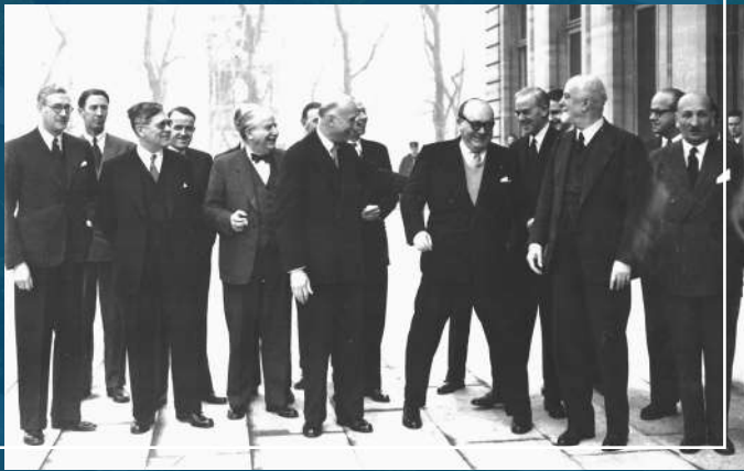
Ministerial Council of the OEEC (1949)

We can trace the history of the Organization for Economic Co-operation and Development OECD—back to the period immediately after World War II, which saw the establishment of other international organizations including the United Nations (1945), the North Atlantic Treaty Organization (1949), and the Council of Europe (1949).