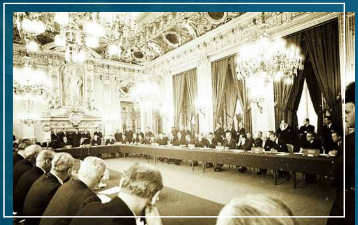
Signing of the OECD Convention at Quai d'Orsay, Paris (1960)

In addition to its 38 member countries, the Organization also has close relations with key partners including Brazil, China, India, Indonesia, and South Africa. By leveraging the relationships with key partners, the OECD gathers around its table a group of countries that account for 80% of world trade and investment, giving it a pivotal role in addressing the challenges the world economy faces.